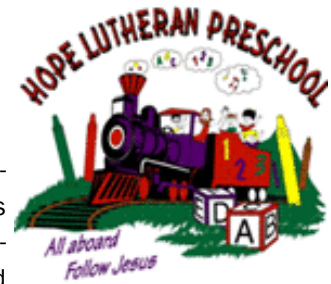
Established in 1996, the congregation now has over 500 families!

Fiber Optic cable was installed throughout campus to connect all three buildings on site. Hope replaced their aging phone system with a ShoreTel VoIP Phone System (50 stations) and found monthly savings by utilizing one of Trident's telecommunication (local, LD, internet) partners. To learn more about the Hope Lutheran visit their website: www.hopelutheranwf.org/